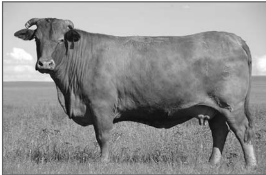
Elite Donor Lasater 6015

13 Embryos by Lasater 3708 & 10 by Lasater 4248